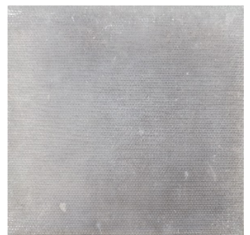
*Charcoal Square, Buff Square, Red Square and Natural Square

Hoddam Contracting Co. LTD do not recommend British Standard concrete paving slabs to be used for decorative projects such as feature patios due to the difference of colour, shade and texture that may vary in natural aggregates. Should the customer choose to accept the use of the range for patio projects, Hoddam Contracting Co LTD will not be held responsible for lack of uniformity subsequently displayed in the finished products appearance. Hoddam Contracting Co LTD try to adhere to promote sound advice to customers and best practice for all our products.