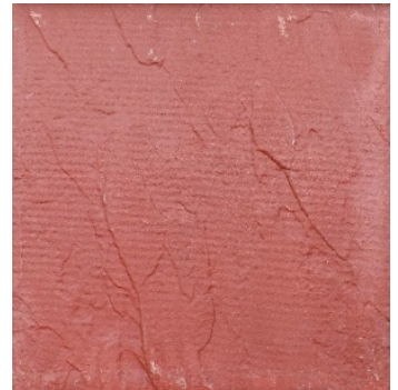
*Buff Riven, Charcoal Riven, Natural Riven and Red Riven